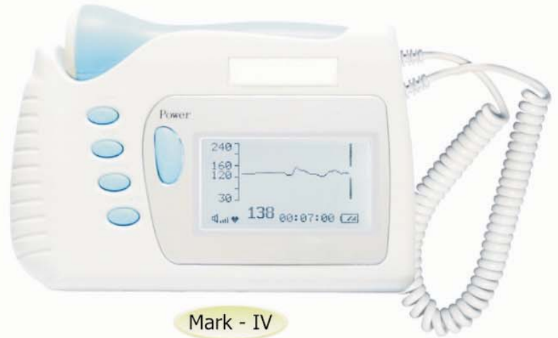
Mark - IV